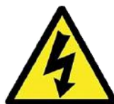
Different Power Supplies 50 – 60 Hz.

*Additional chambers *60 Hz motor *Green passport *Bale strapping